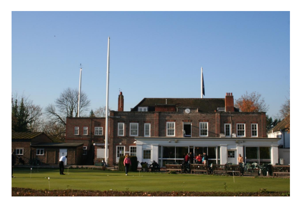
The rear of the clubhouse showing the radio masts - flagpoles