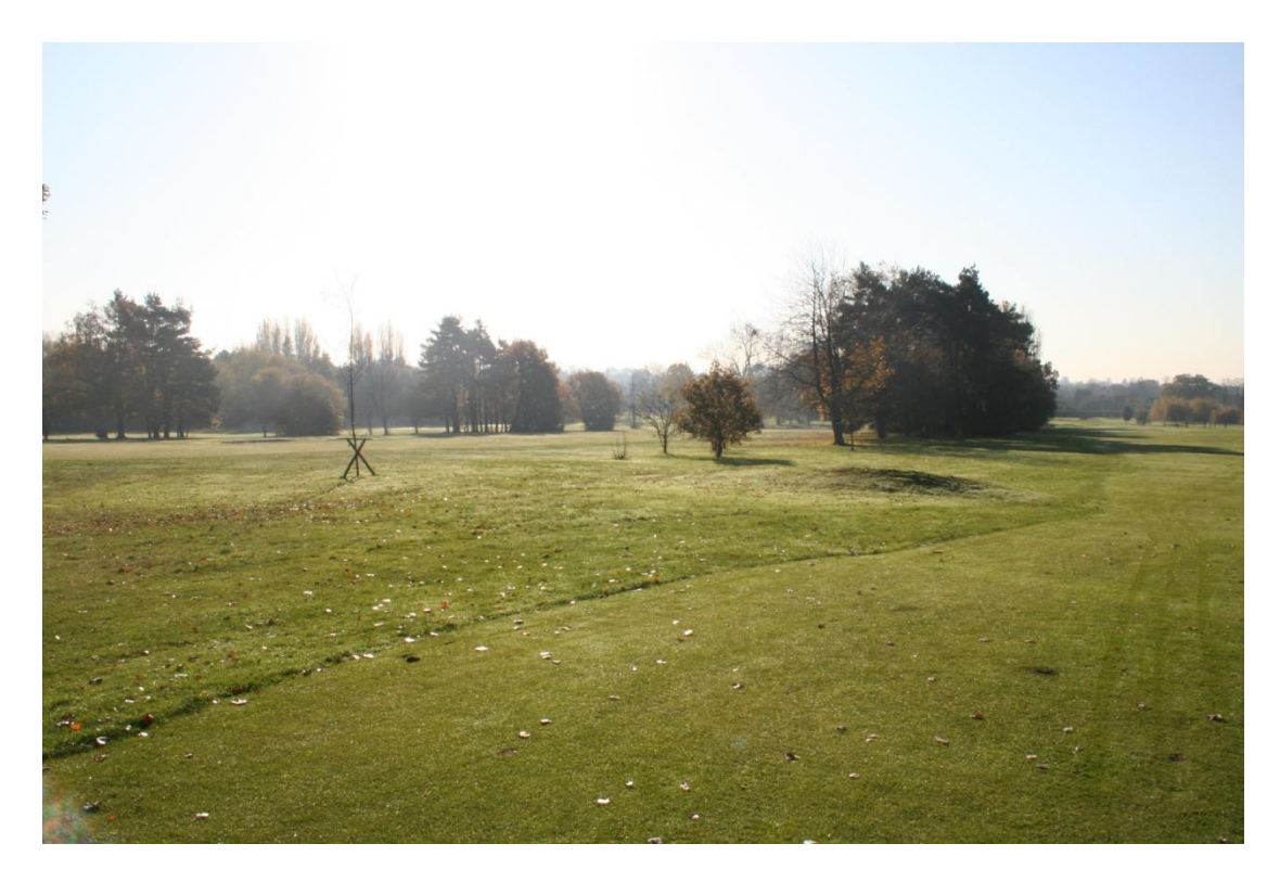
Young trees planted between 15<sup>th</sup> and 16<sup>th</sup> fairways.