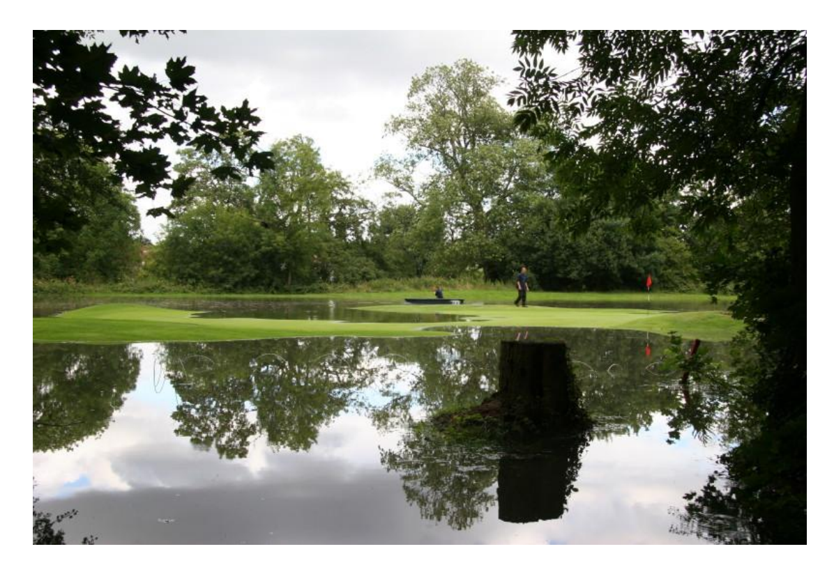
A fishing lake or golf course

gravel banding was carried out on the 1<sup>st</sup>, 5<sup>th</sup> and 17<sup>th</sup> greens. It is not suggested that this drainage expenditure stopped the flooding but it had a great effect on the dispersal of the water in normal wet conditions and helped to clear the water quickly when flooding took place. Perhaps the best way to emphasise the vagaries of the weather was the introduction of drought orders by water providers during the summer of 2006.