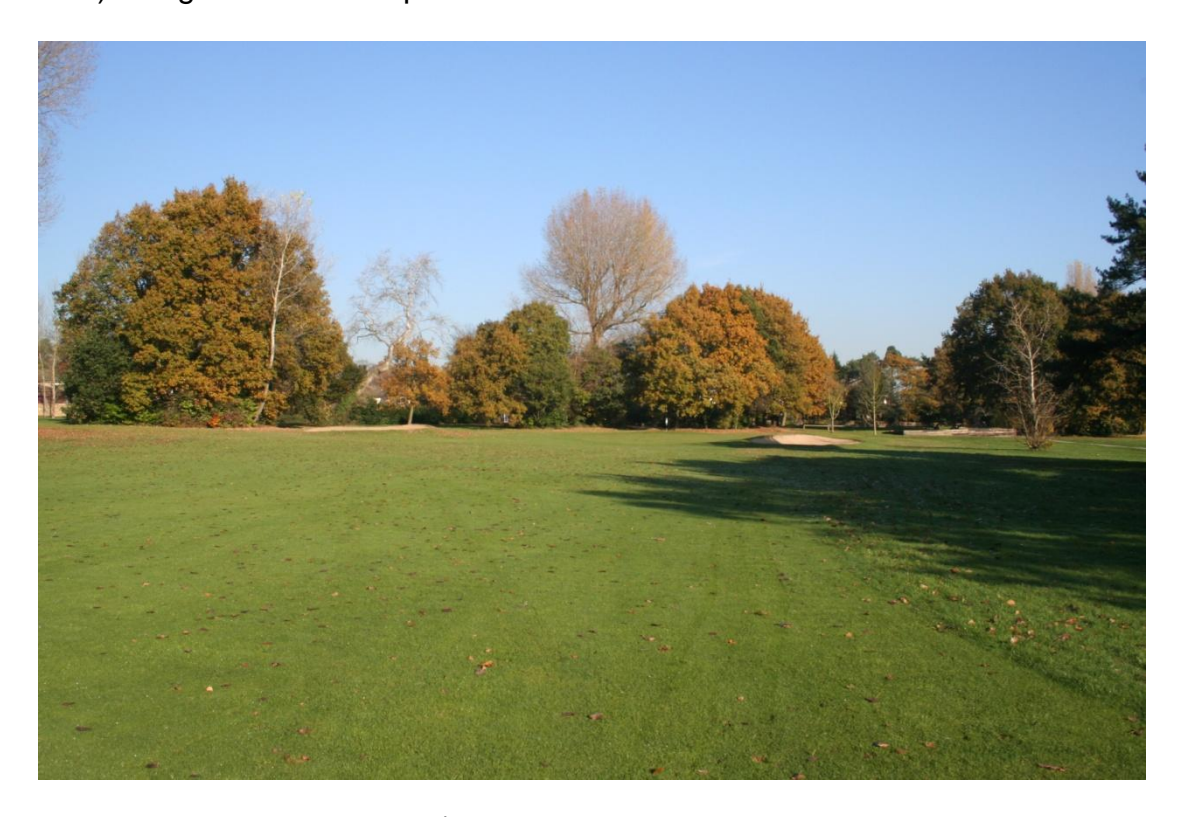
A picturesque view of the 16<sup>th</sup> green in Autumn.

For the gentlemen, it boasts 3 par 5's, 4 par 3's and the remainder par 4's adding up to a par of 71. For the ladies, par is 72 with the 8<sup>th</sup> (A par 4 for the men) being an additional par 5.