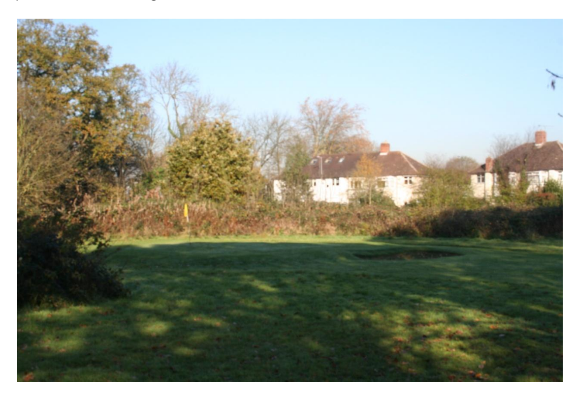
New practice bunker and green by 8<sup>th</sup> fairway

creation of a putting green with a greenside bunker allowing members to practise their short game.