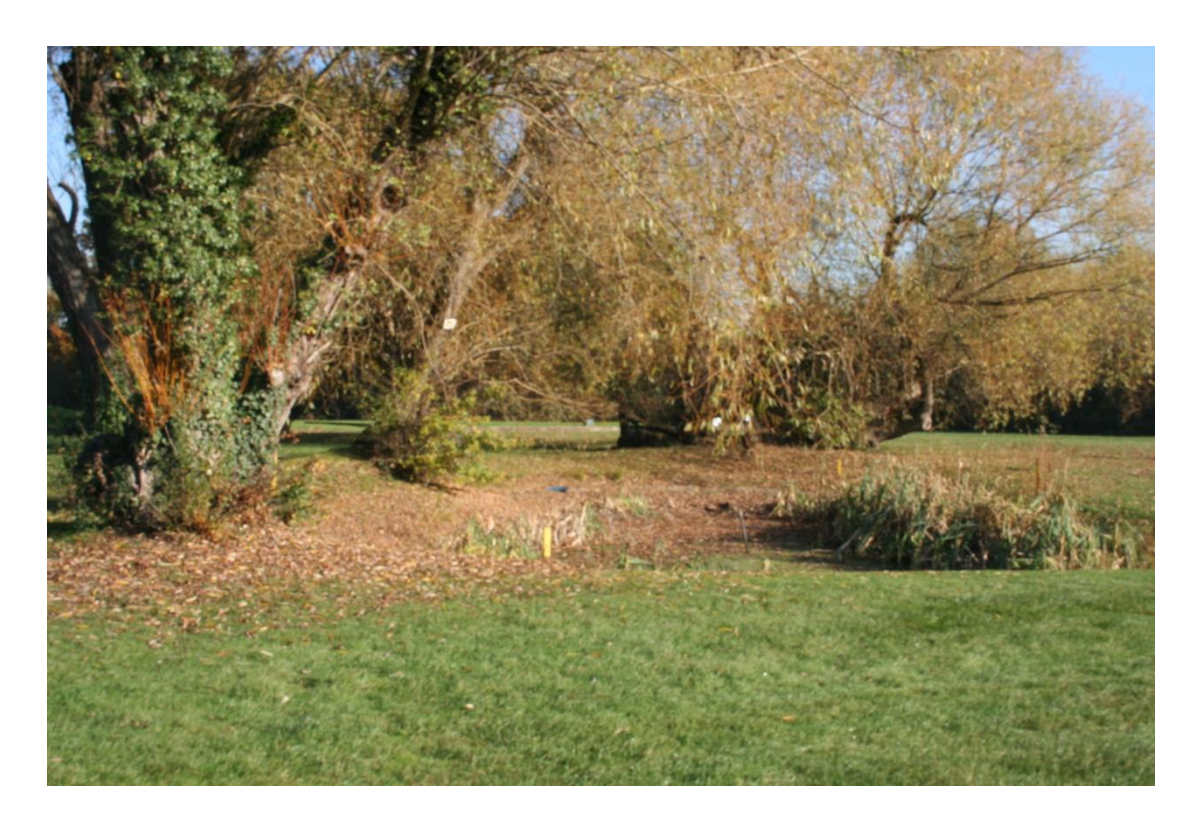
The lake by the 2<sup>nd</sup> green – almost dry even in Autumn

During the period, the green staff have also introduced drainage in key locations such as the right of the 5<sup>th</sup> fairway and to the left of the 14<sup>th</sup> fairway as well as other main areas of dampness. In addition, the club purchased a water pump in an attempt to alleviate the problem..