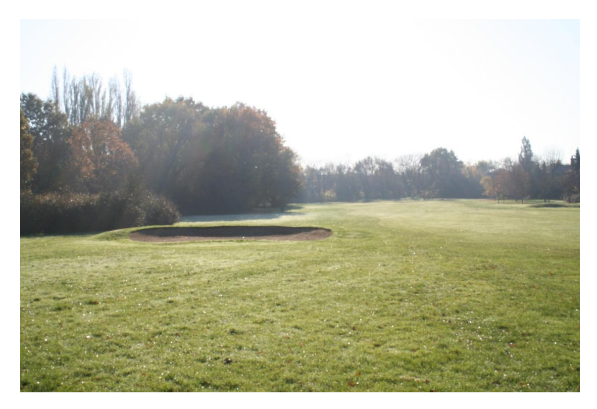
New bunker to left of 6<sup>th</sup> fairway.