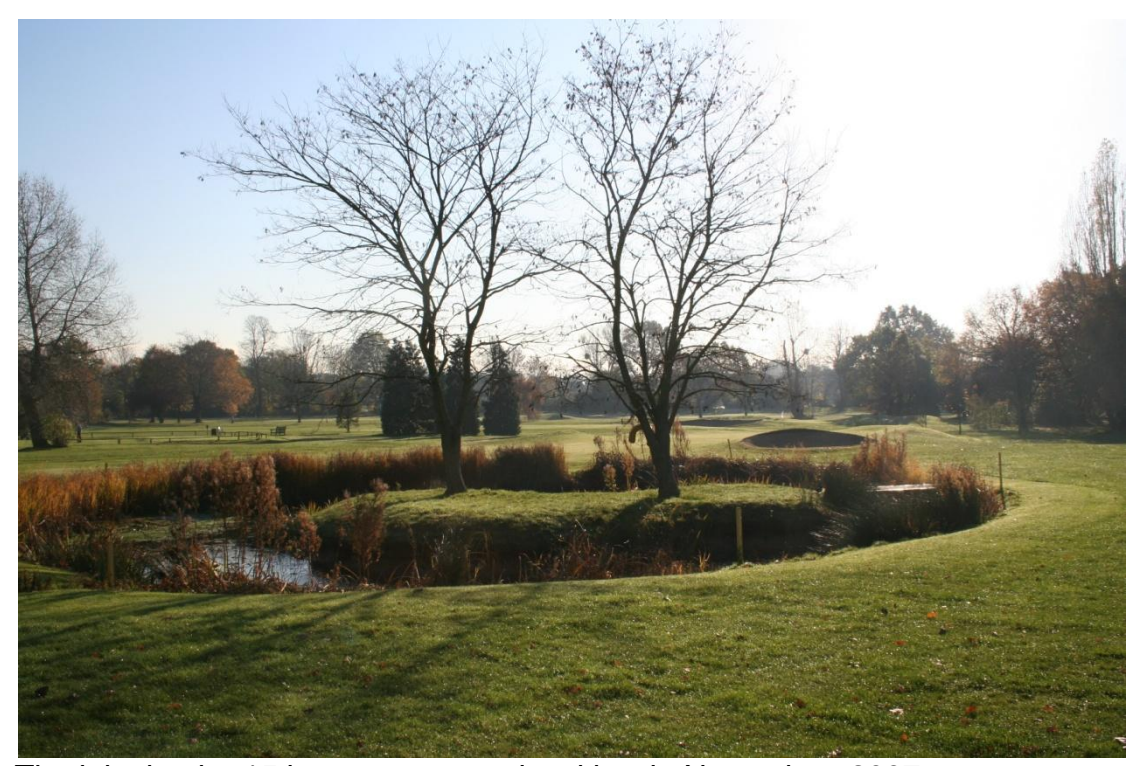
The lake by the 15th green – water level low in November, 2007

Unfortunately, the course has always suffered from wet conditions in winter and over the period under review, a number of efforts have been made to ease this problem. In August, 1994, a new lake was created by the 15<sup>th</sup> green to allow excess water to run into it then be piped elsewhere. In September, 1995, an overflow from the new lake was made to the pond to the left and short of the 2<sup>nd</sup> green in an effort to make a more permanent feature.