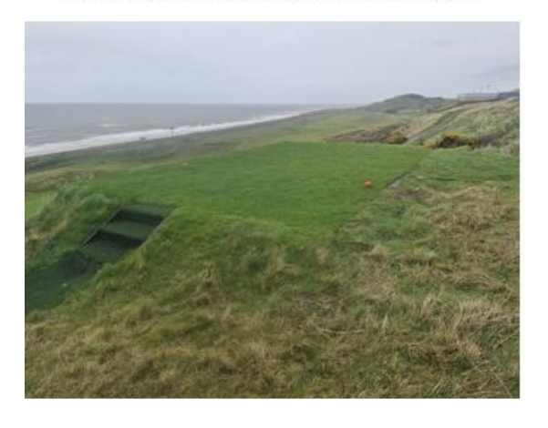
Levelled & re-turfed ladies 17th tee.