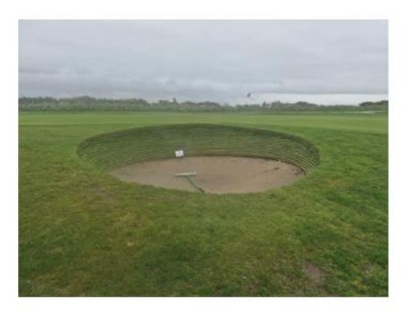
Re furbished 5th hole bunker front right