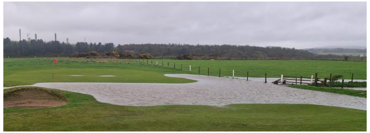
3<sup>rd</sup> Hole awash.