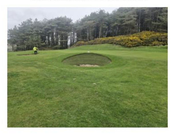
Re furbished 11th hole front left