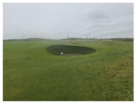
Re furbished 2nd hole greenside bunker