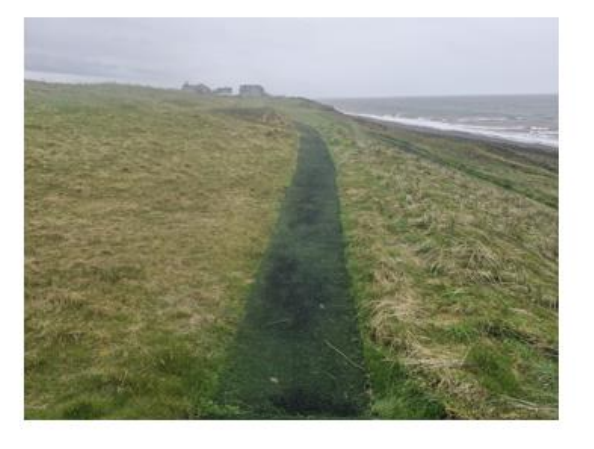
New path to ladies 17th tee