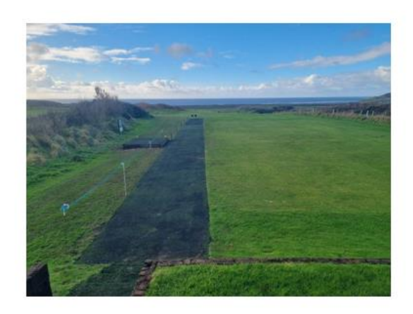
New path up to the 9th white tee