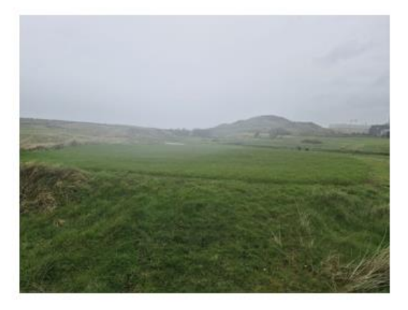
Levelled and turfed 10th upper tee