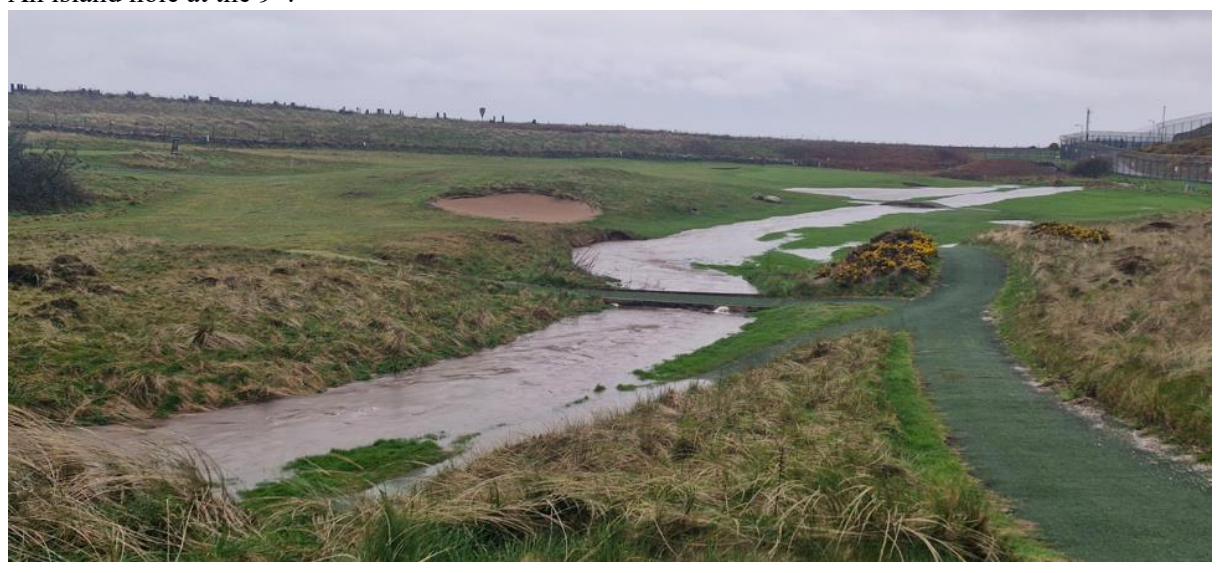
Trouble at 13th.