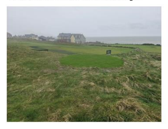
New 18th white tee