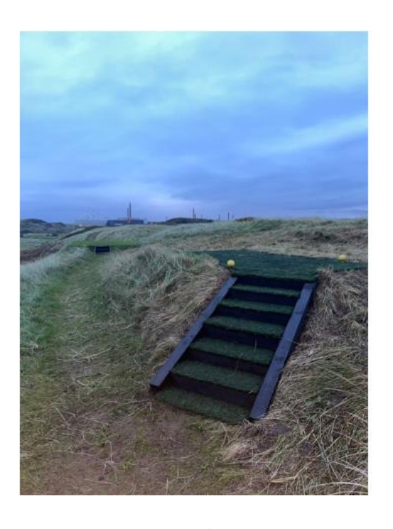
New winter 17th tee