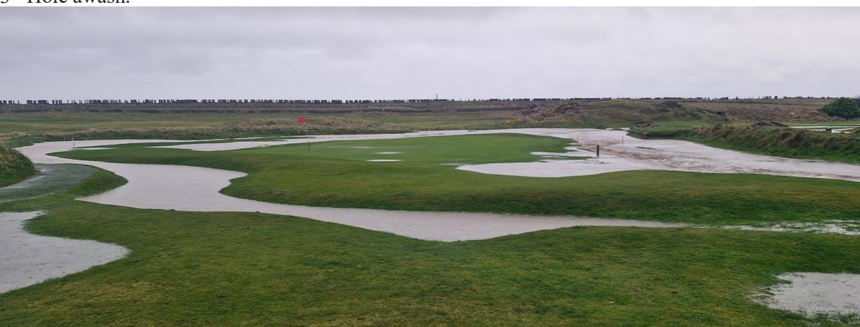
An island hole at the 9<sup>th</sup>.