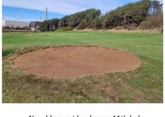
New blow out bunker on 11th hole