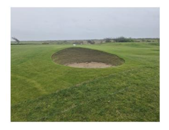
Re furbished 12th hole front left bunker