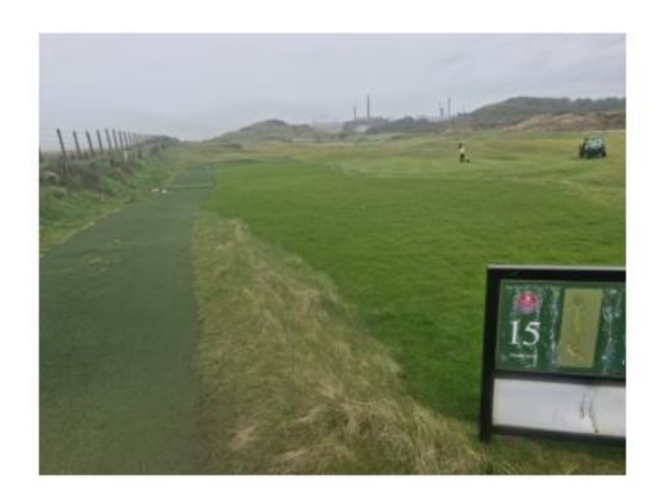
Levelled & re turfed 15th tee