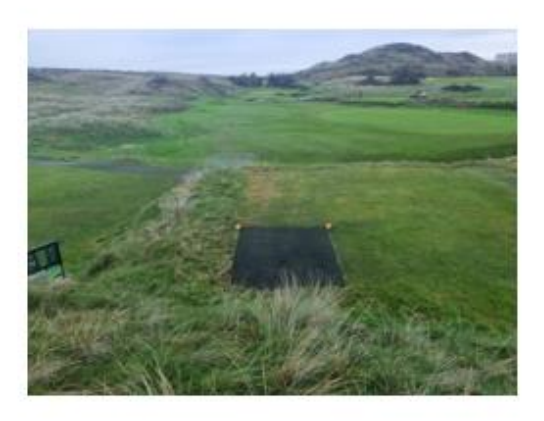
New 10th winter tee