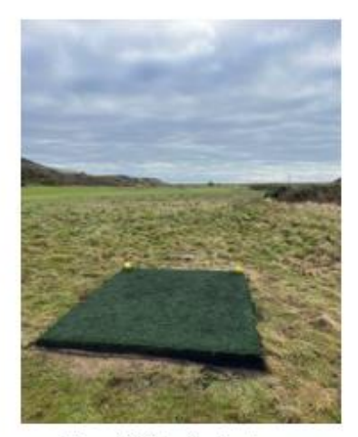
New 12th winter tee