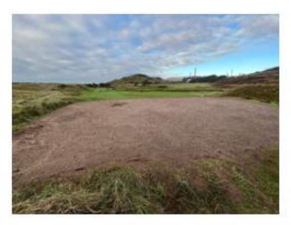
10th medal tee stripped of turf levelled and ready for re-turfing