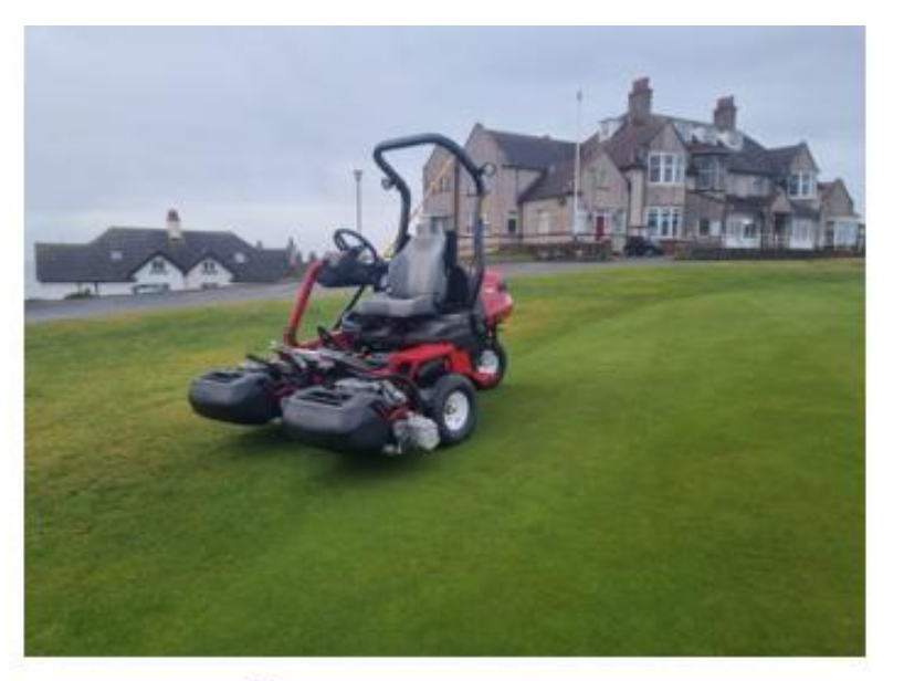
Our new greens mower