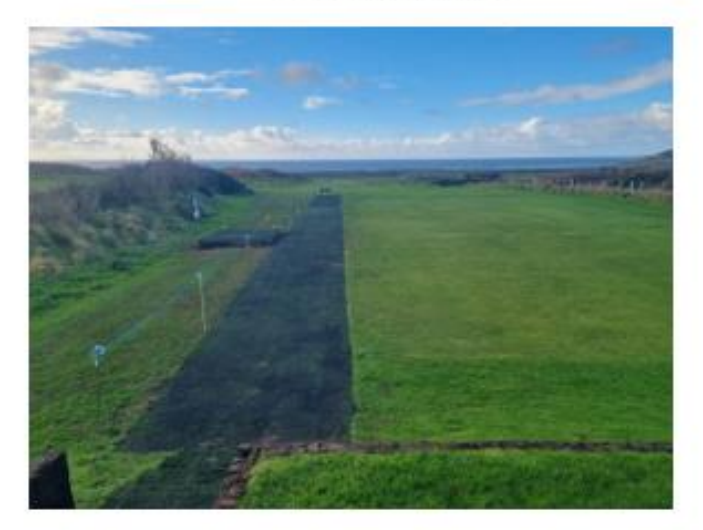
Fantastic job of new path to the 9th tees

Re-furbishment of front left bunker on 12