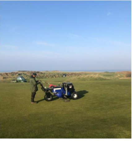
Guy with our own Air2G2 machine on 5th Green injecting compressed air into the root zone.

We received the quote in December for the work to provide a working borehole with potentially more than enough capacity to cover our current needs and possible future enhanced irrigation. We will need consents and an abstraction licence which the project engineer deals with. Adam worked closely with the consultant to achieve this project before the dry weather kicks in.