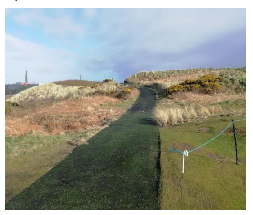
The much-improved path from 7<sup>th</sup> to the 8<sup>th</sup> Tee.

Despite some diabolical storms and wet weather this winter our greens staff have worked really hard on improvements, while keeping the course in great condition. We have had visitors to the club remarking how lucky we must feel to have such a course available to us all year round. Below we have selected a few photos to show the progress made this winter, building on the year-by-year improvements at Seascale.