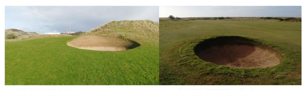
Refurbished 15th bunker.