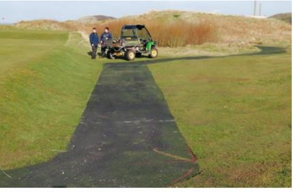
Kyle and Will - Joined up path from 6^{th} Blue Tee all the way to fairway.