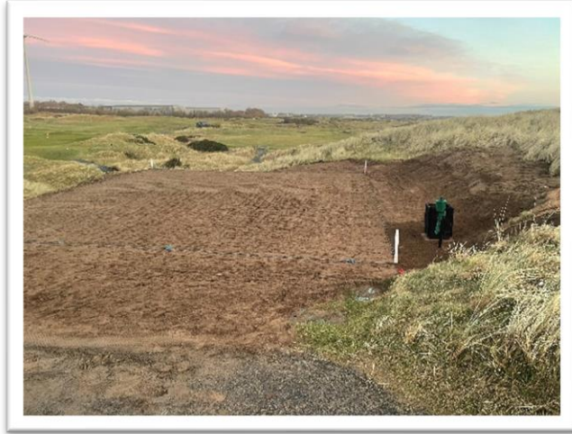
Pictures of the work carried out at the 5 th tee to have both tees on one level.

All tees were top dressed and sprayed with the same turf tonic as the greens and approaches. Mowing was carried out at 6mm HOC. The yellow and red tee at the 5 th holes was changed to have both tees on one level. The path at the front of the tee was reinstated to improve access to and from the tee.