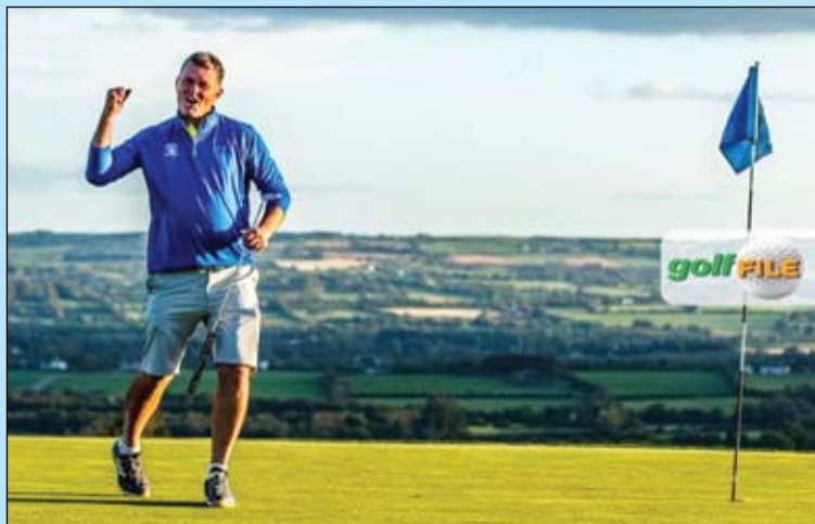
The Winning Putt

It's the first time in six years that we have won the Munster pennant and we will be hoping to repeat the provincial/national double of 2013/4. The latest update we have (Feb 2021) is Golf Ireland are still planning to play the 2020 All Ireland series and we await the plans.