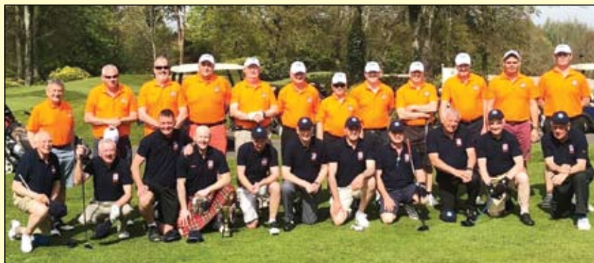
Men's Outing 2019

There are many companies organising golf trips and it is great to be able to play in sunshine on courses in Spain and Portugal. In Feb 2020 eight members of Spanish Point played for Munster, led by rugby legend David Wallace, versus Leinster in Vilamoura in Portugal.