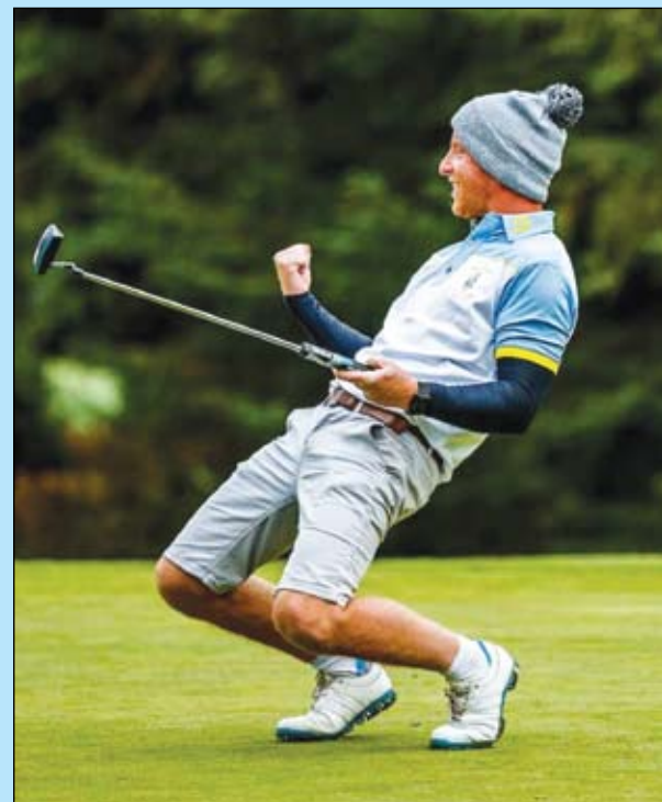
The Winning Putt

Handicap Indexes are calculated from an average of the best eight of your last 20 returned scores. When a new score is submitted, the Handicap Index is automatically recalculated and updated at the end of the day's play, ready for use the following day.