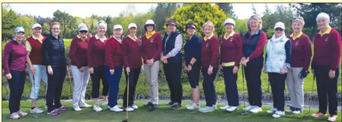
Above: Ladies Outing to Athenry 2019