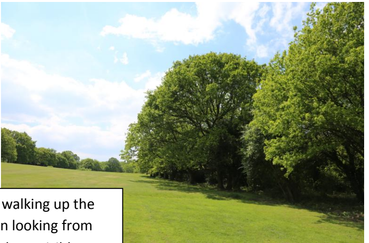
The view now when walking up the 6 th /15 th fairway when looking from both left and right. These visible Oaks were surrounded by brambles and holly before they were reclaimed.