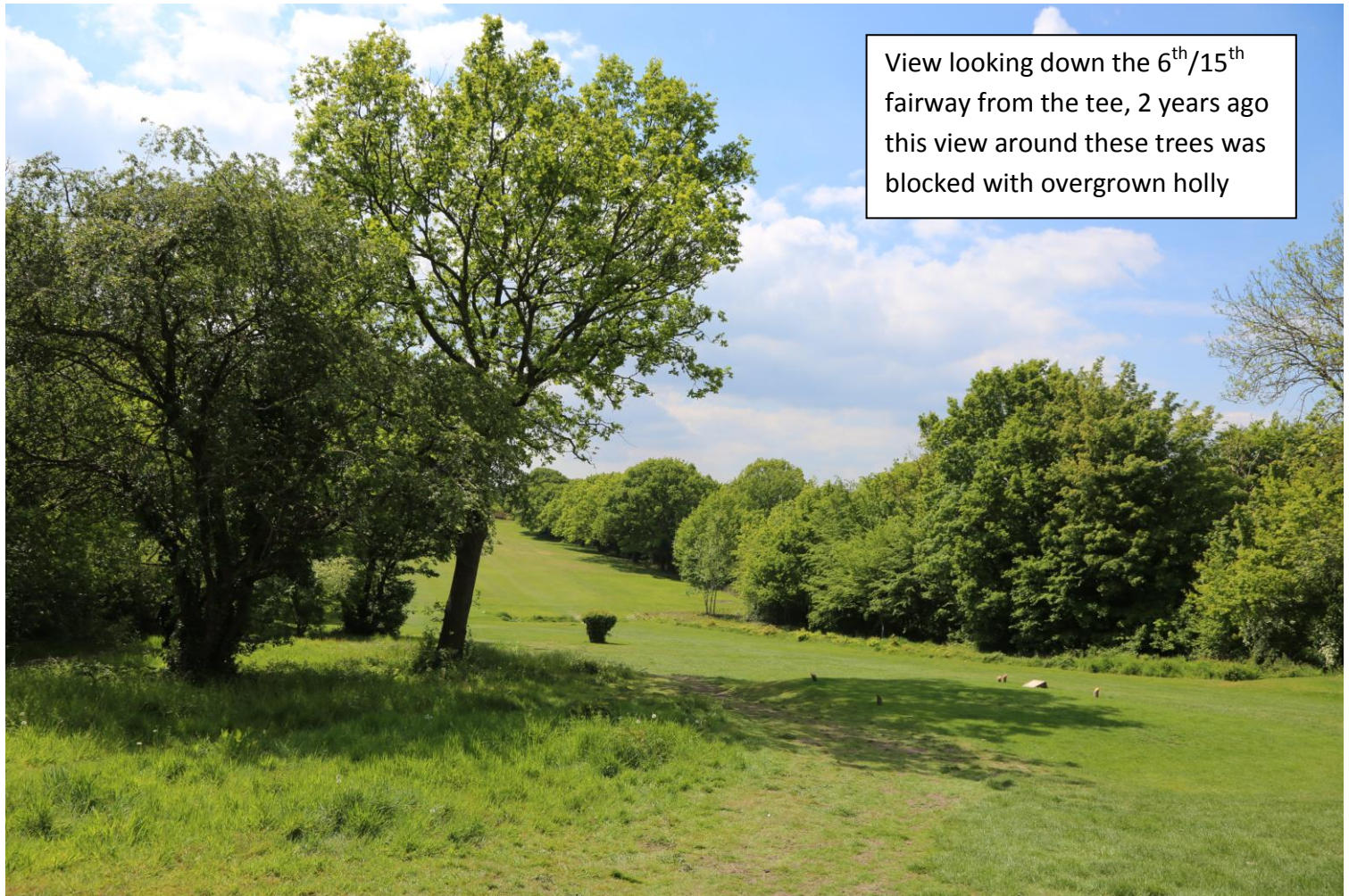
View looking down the 6 th /15 th fairway from the tee, 2 years ago this view around these trees was blocked with overgrown holly