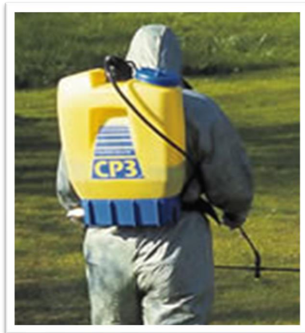
Knapsack Treating Weeds

Last week a weed killer application was applied to all the paths and steps around the course to tidy them up. These weeds are now starting to turn yellow and should be free from over growing unsightly weeds over the coming weeks.