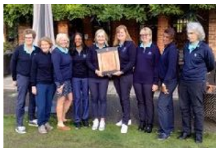
Bucks Shield Winners Gerrards Cross