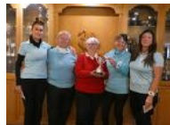
Interclub Foursomes Harewood Downes