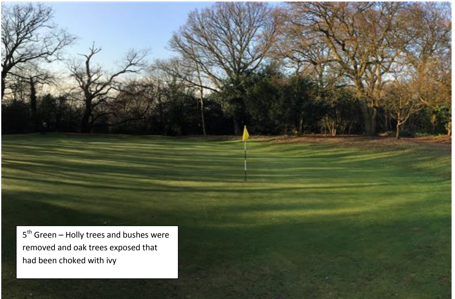
5 th Green – Holly trees and bushes were removed and oak trees exposed that had been choked with ivy