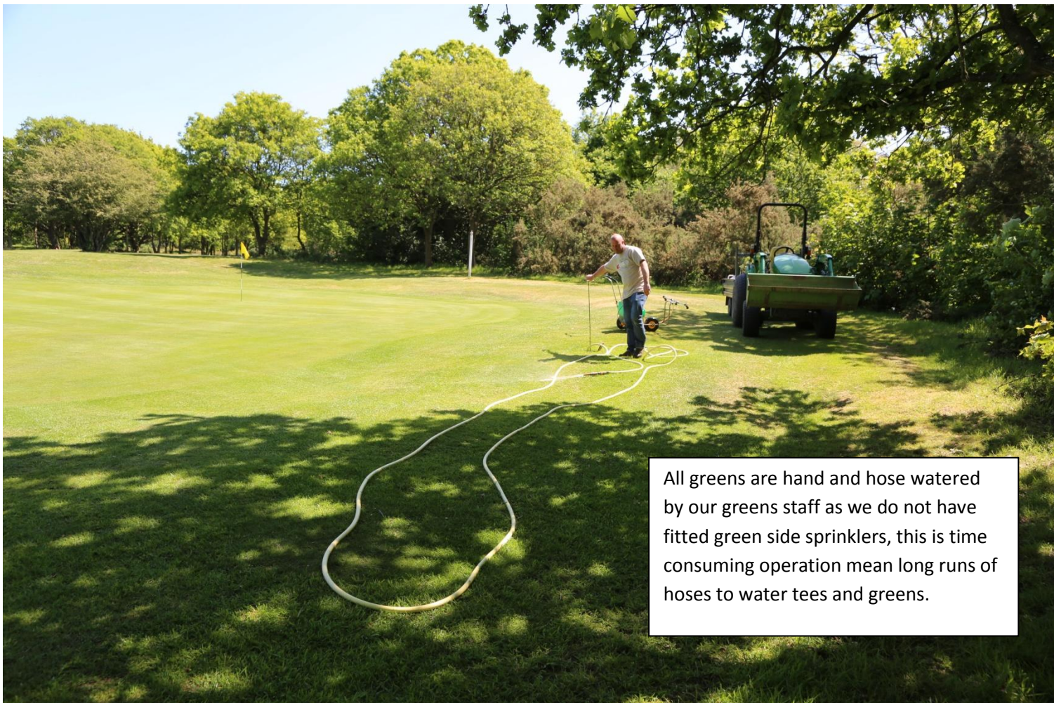
All greens are hand and hose watered by our greens staff as we do not have fitted green side sprinklers, this is time consuming operation mean long runs of hoses to water tees and greens.