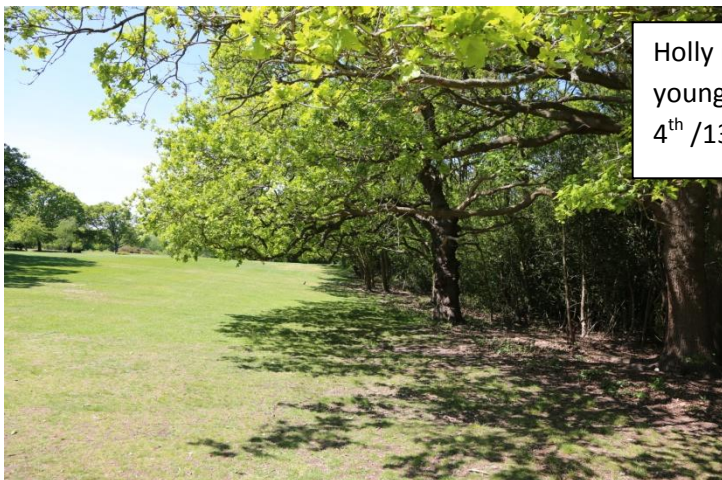
Holly removed to expose this line of young oak's that were being choked on 4 th /13 th Fairway (May 2019)