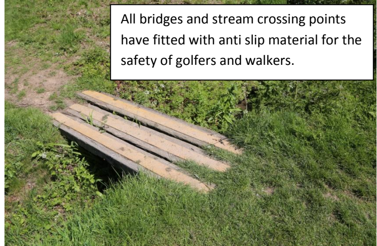
All bridges and stream crossing points have fitted with anti slip material for the safety of golfers and walkers.