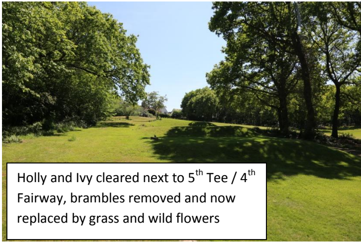
Holly and Ivy cleared next to 5 th Tee / 4 th Fairway, brambles removed and now replaced by grass and wild flowers