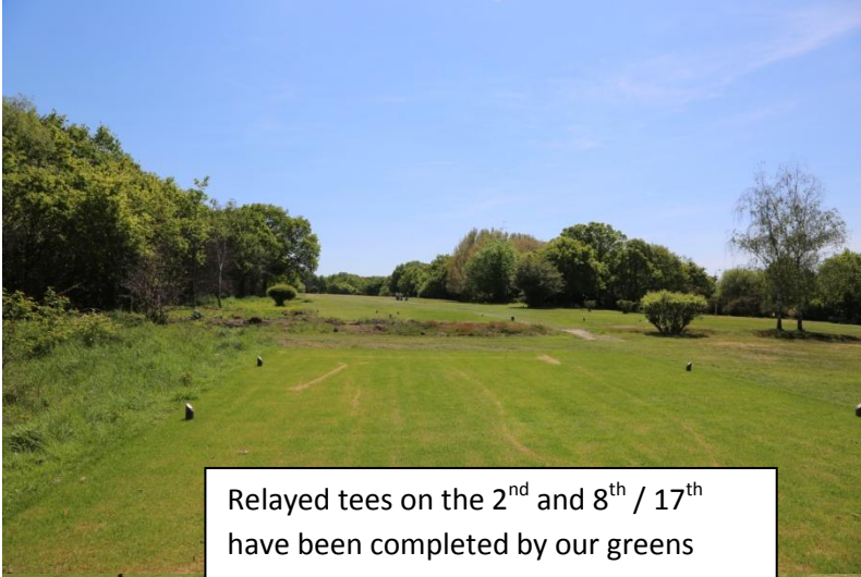
Relayed tees on the 2 nd and 8 th / 17 th have been completed by our greens staff