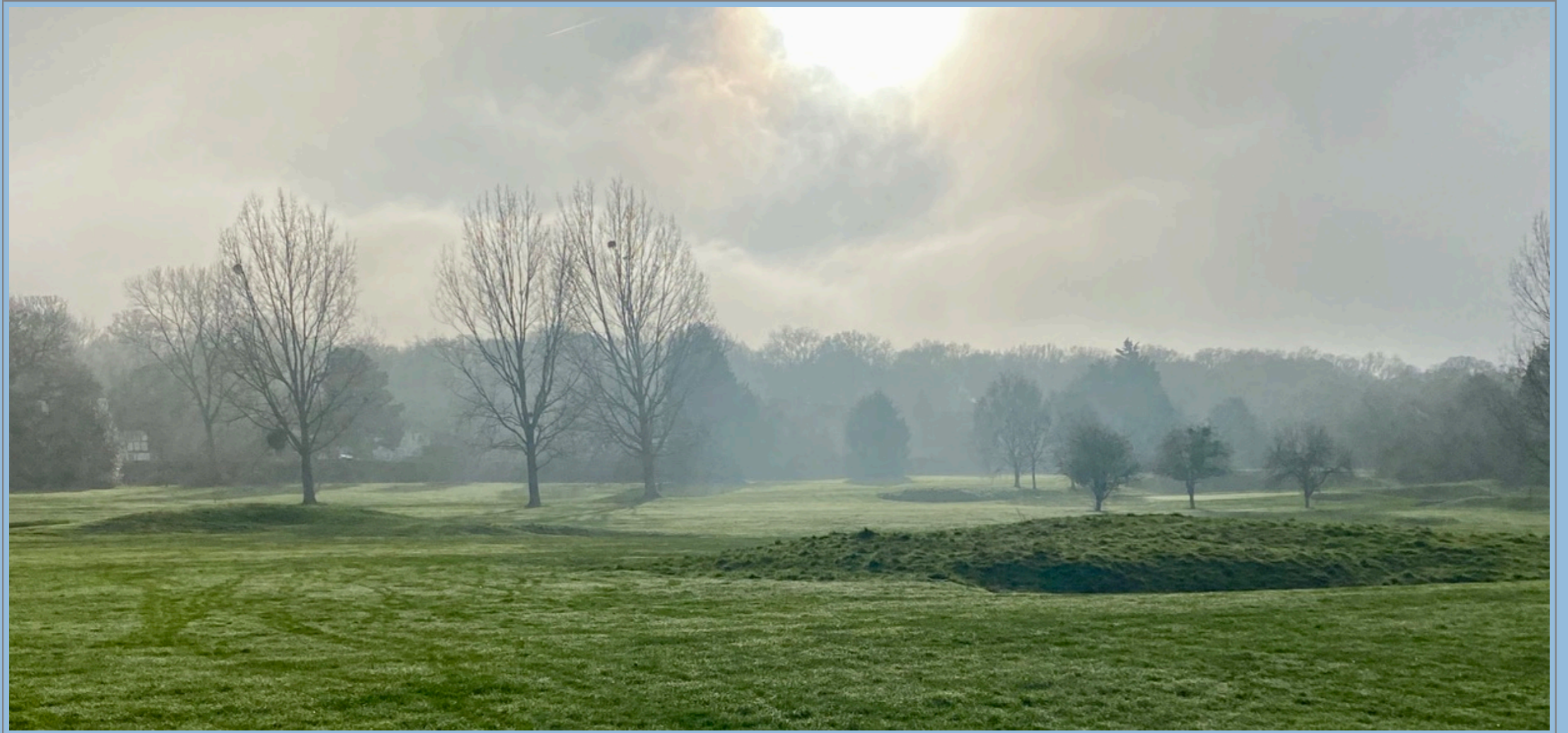
Shirley Park Golf Club, 9 January 2021, during lockdown