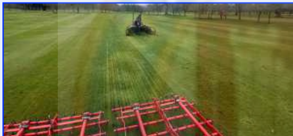
Scarifying the fairways