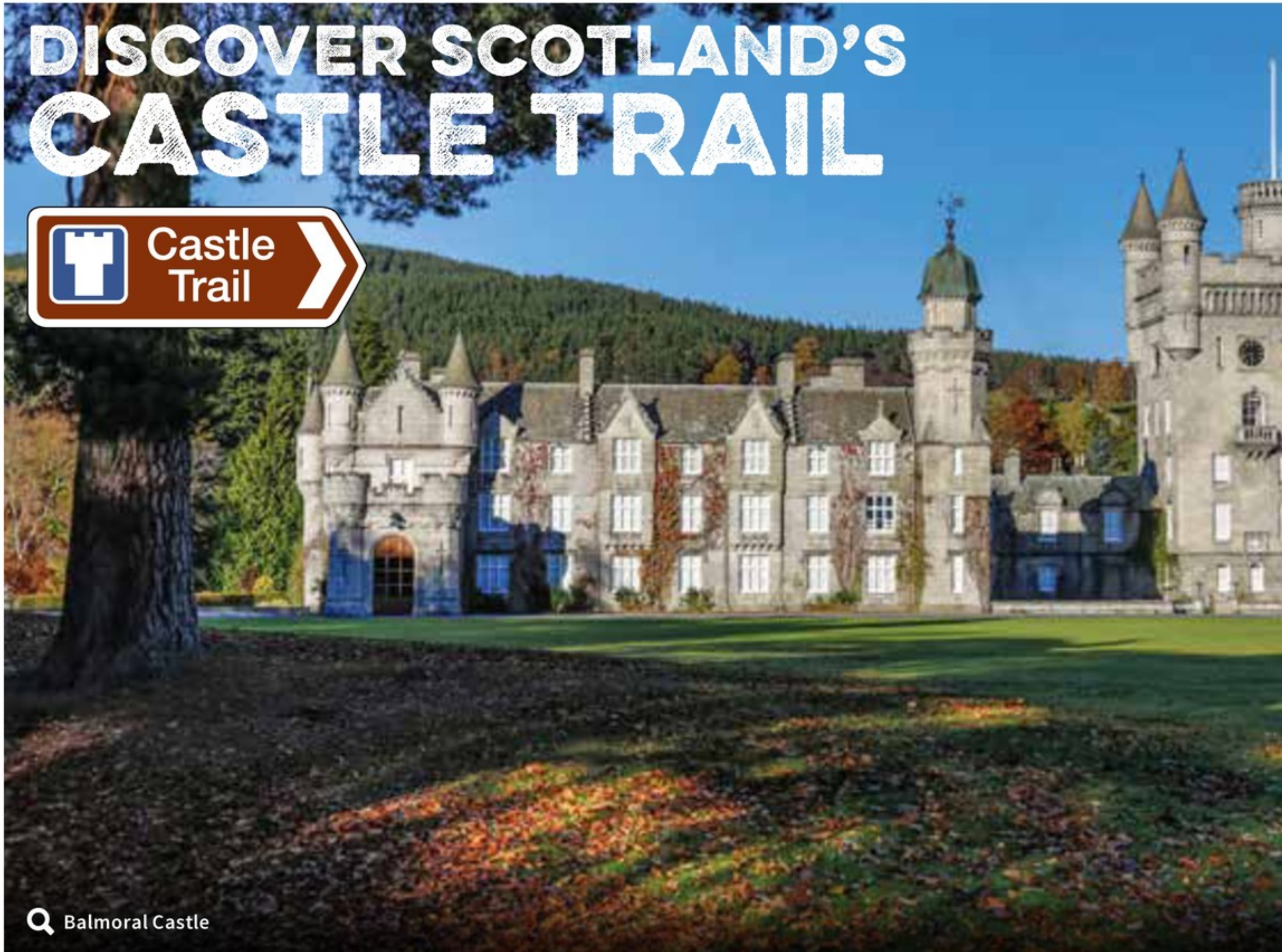
Q Balmoral Castle