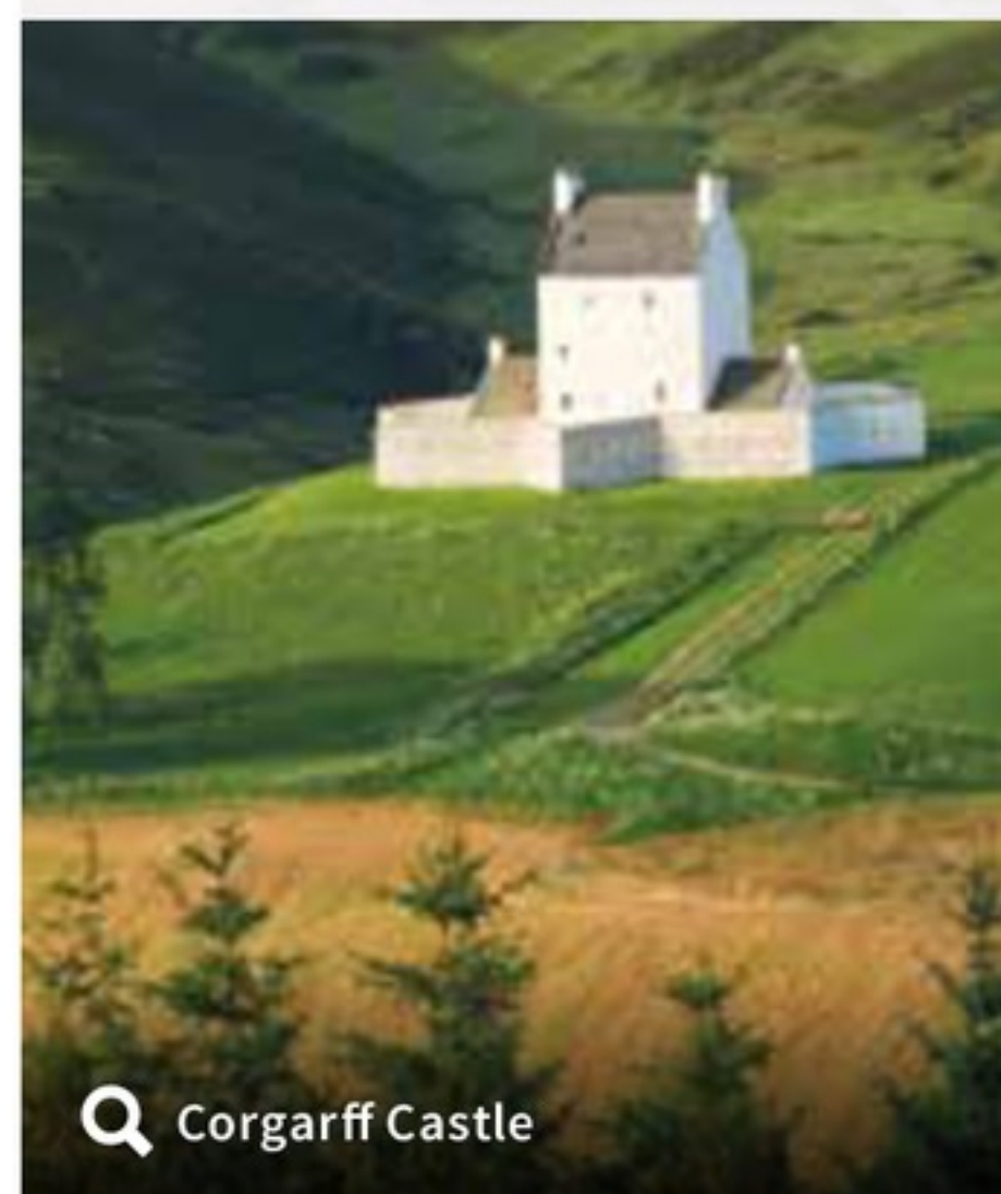
Q Corgarff Castle

Kinnaird Head Castle, which has been a castle, a lighthouse and is now a museum.