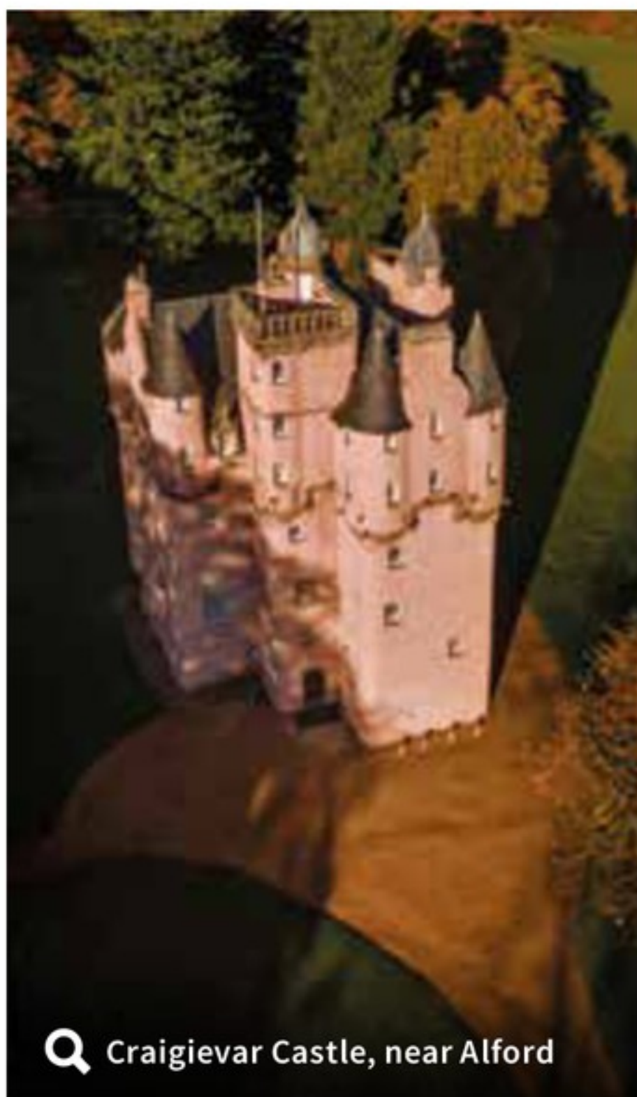
Q Craigievar Castle, near Alford

You will not be able to visit this region without seeing a castle – there are more per acre in Aberdeen and Aberdeenshire than anywhere else in the UK.