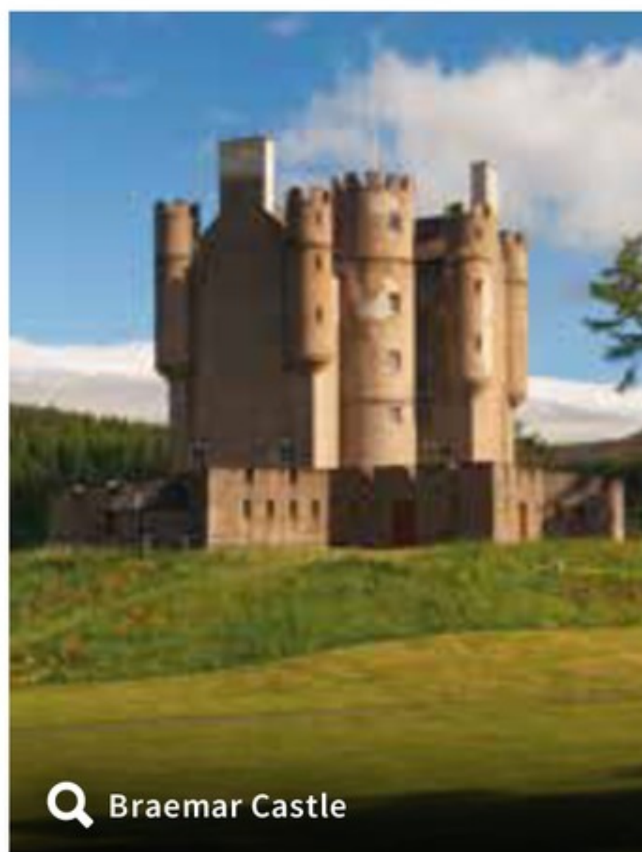
Q Braemar Castle