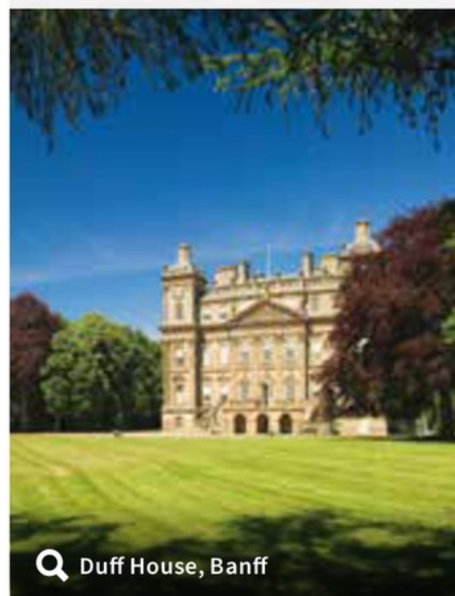
Q Duff House, Banff