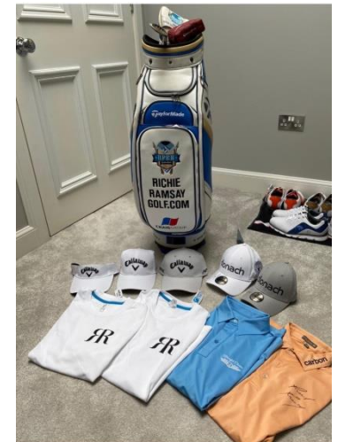
(Shoes not included)

Our funds have increased significantly over the last few days and we are nearing our target of £12,000 which is unbelievable! A sincere thank you to everyone who is supporting us!