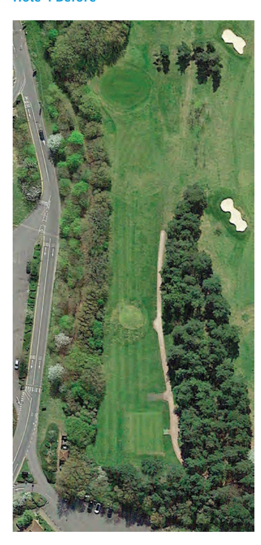
Hole 4 Before