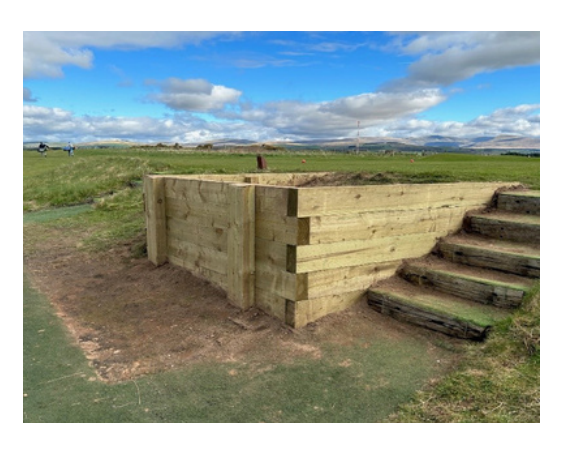
Work ongoing to provide a new winter tee on the 2nd hole which will provide a safe full view of oncoming pedestrians alongside the 2nd fairway. Rest assured measures will be made to enable safe operation, work is not complete.