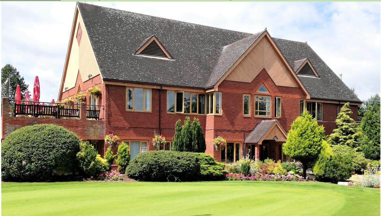
The Doncaster Golf Clubhouse 13 th July 2019