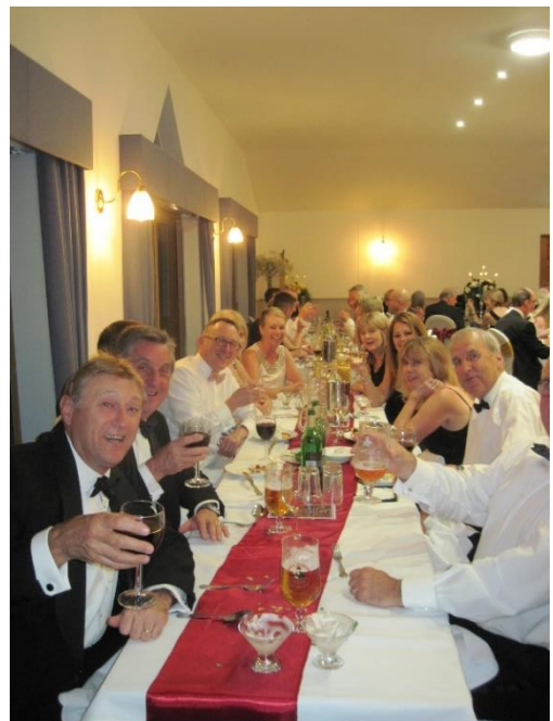
A table of ex hockey club members.

The Rabbits have also supported the other Anniversary events held during the week, The Golfer/Non-golfer, The Green Keepers Revenge,