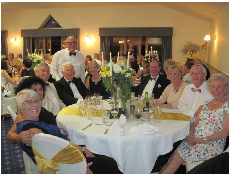
A table of Rabbits and their wives enjoying the evening.

Dinner, of which twenty percent were Rabbits and their partners.