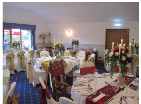
The dining room with a WOW factor.