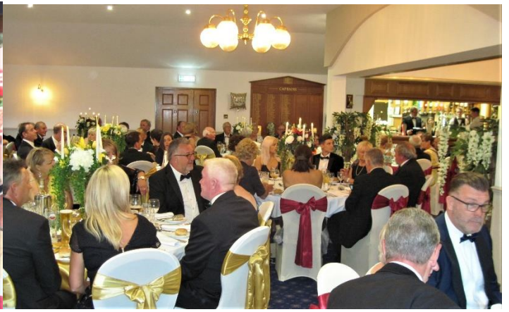
A general view of the diners.

the Saturday Am-Am and the Waltz played by the combined Seniors and Rabbits.