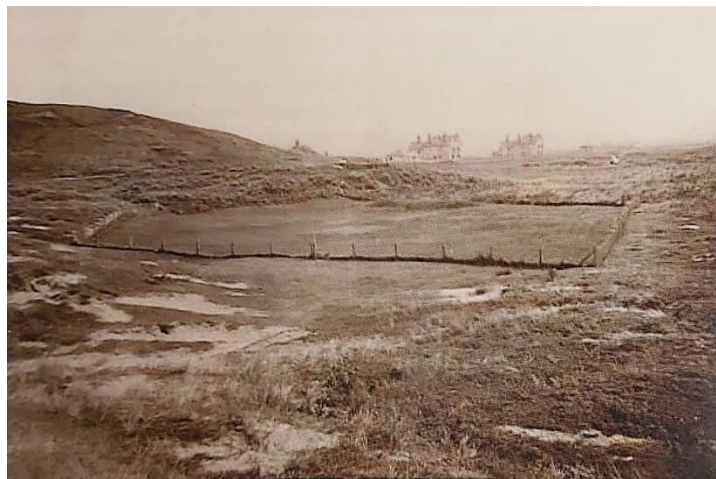
1906: 11th green. 'Much bigger than of old'