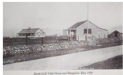
Borth Golf Club House and Bungalow, May 1904