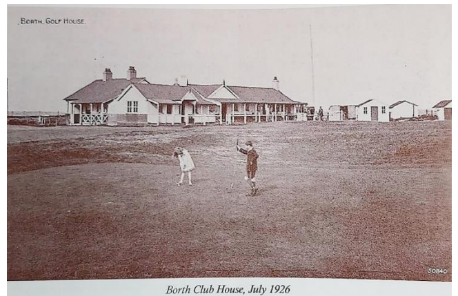
Borth Club House, July 1926