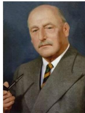
Harry S. Colt

Following requisition of the course by the military during World War 2, the club received compensation for the damage caused by the army during the war, and in 1947, the course was re-designed by Harry Colt to a total length of 6,061 yards, par 72. The 7 th was extended from a par 3 to a short par 4, the 8 th and the 10 th were both lengthened to become par 5 and the 9 th reduced to a par 3. Colt also introduced changes to the 14 th and the 16 th holes.