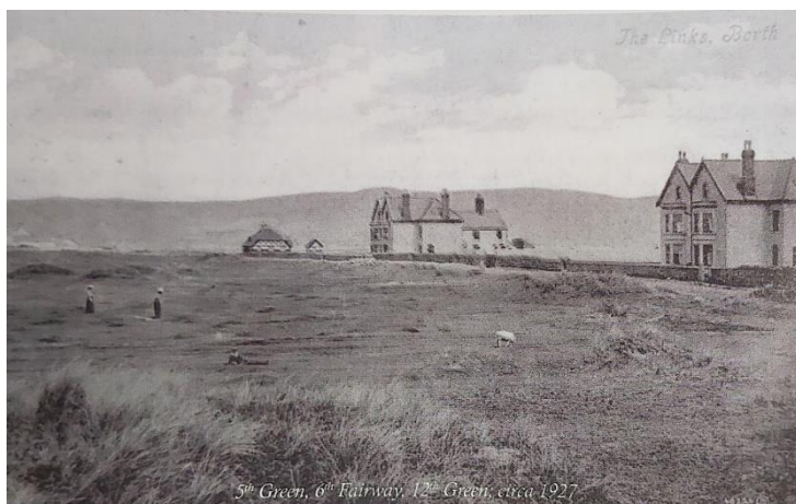
5 th Green, 6 th Fairway, 12 th Green, circa 1927

Borth and Ynyslas Golf course yardage was 5,878 yards, par 71 and SSS 73.