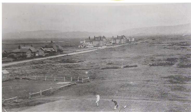
6 th Hole, June 1927