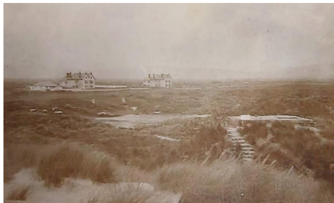
1906: 12 th tee