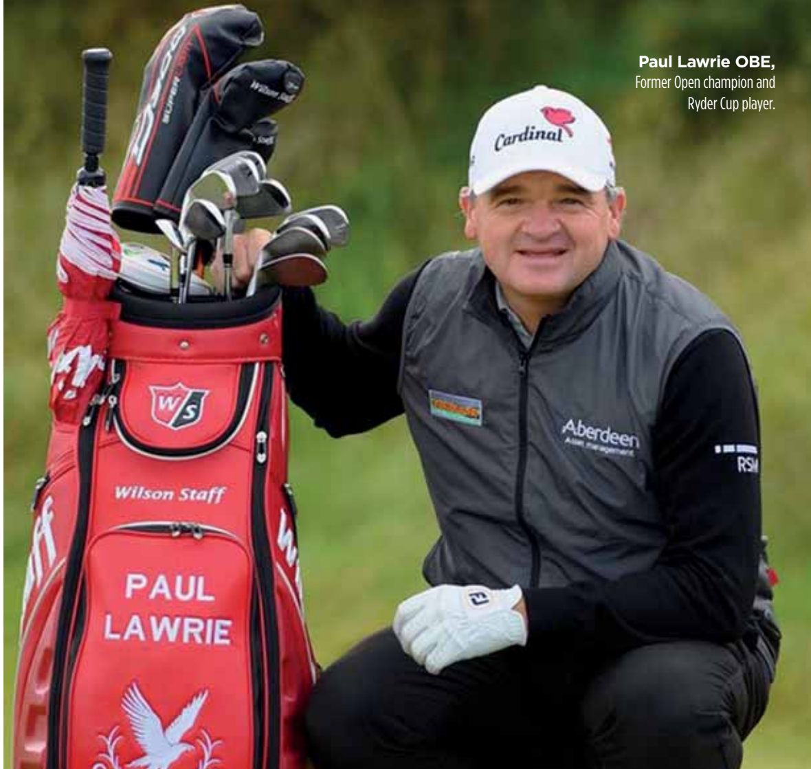
Paul Lawrie OBE, Former Open champion and Ryder Cup player.