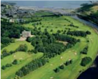
Tour 18 Page 23 - 26 Favourite 18 holes in the area chosen by local Golf Pros