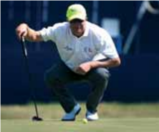
Interview Page 14 Q&A with PGA Tour Pro, Greig Hutcheon