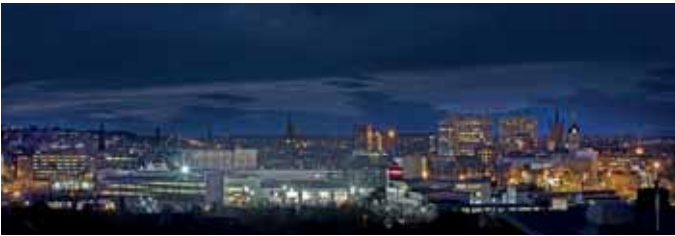
48 hours in Aberdeen and Aberdeenshire Page 5 Where to stay and places to eat