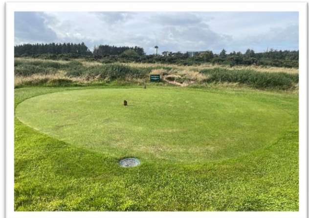
15 th RED TEE