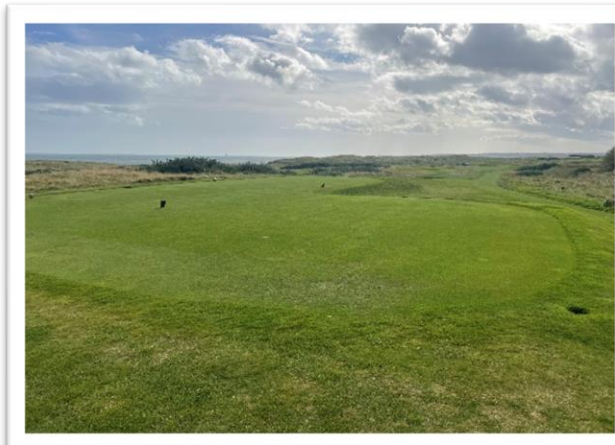
13 th YELLOW TEE

The bases for new tees at the 3 rd hole will be constructed on the bank below the 16 th tee. This will involve clearing all vegetation from the bank before cutting and filling the new tee bases into the bank. A path to the new tees will also be added at this point as will new water pipes for the irrigation system.