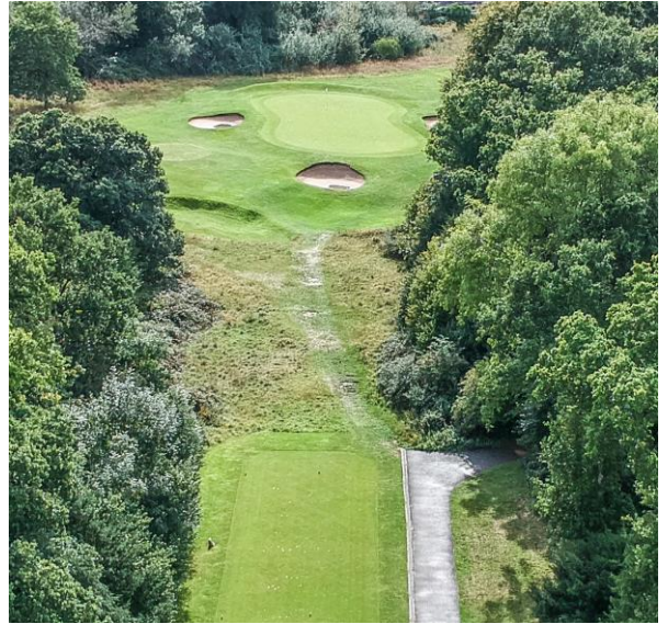
14th Hole pre woodland management.