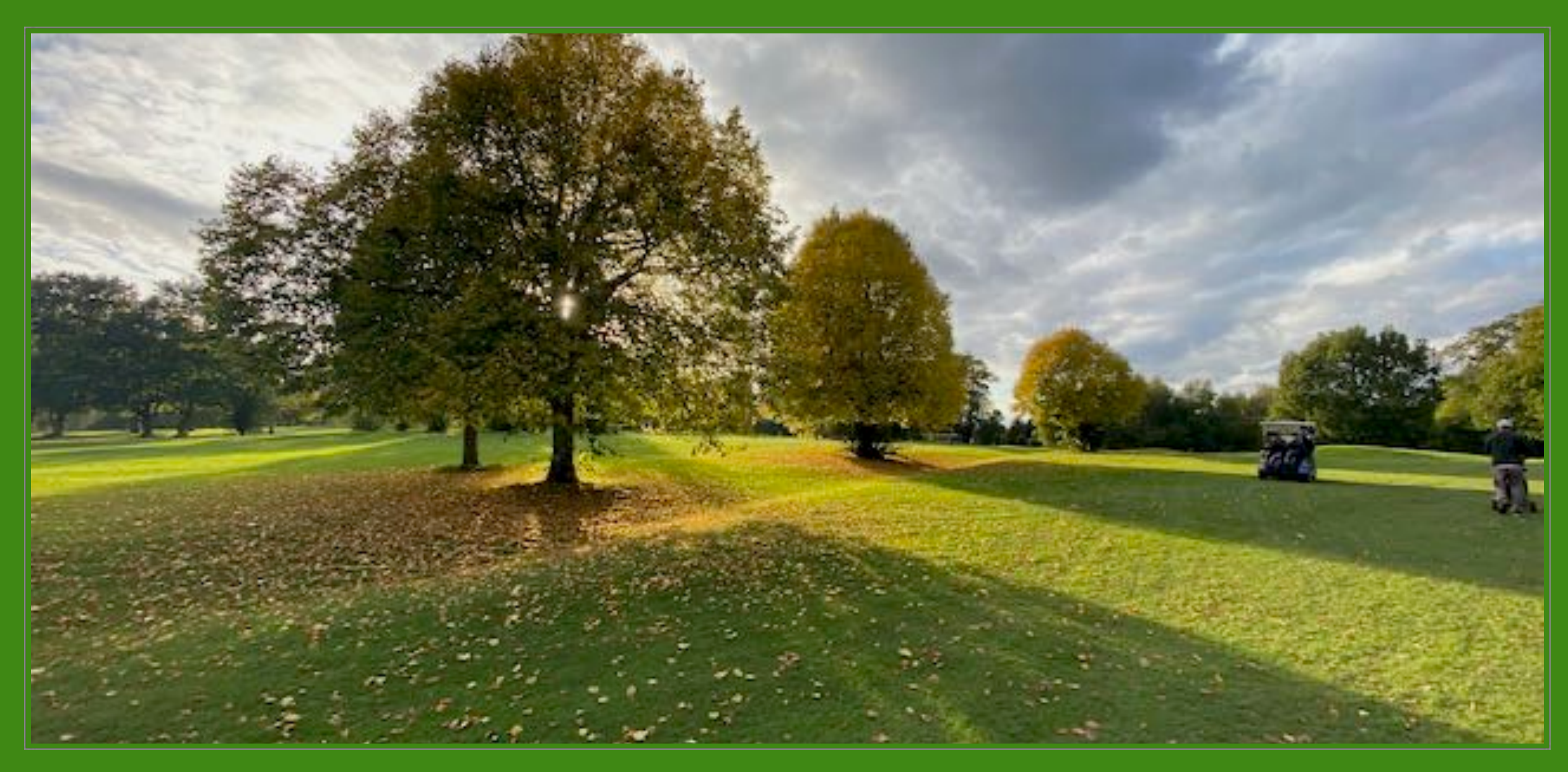
Shirley Park Golf Club, 15 October 2021