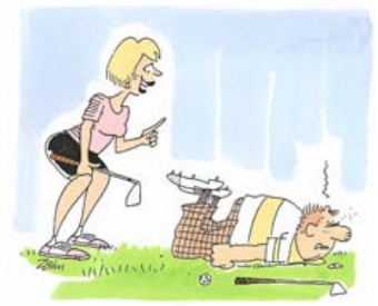
'Seeing I had already hit you once, was I correct in yelling EIGHT?"

Coming up in October, every Sunday afternoon there will be a Junior roll up for any juniors of any ability. See the junior