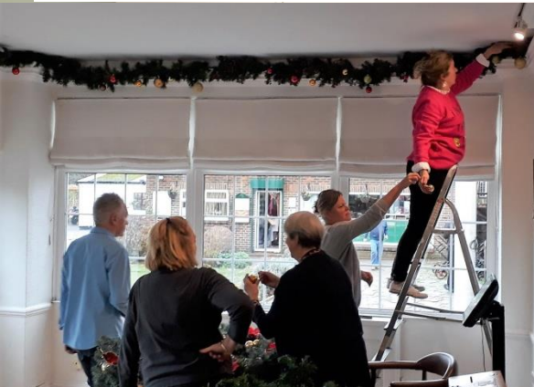
'nail, hammer, scissors...that should do it'