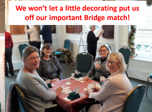
We won't let a little decorating put us off our important Bridge match!