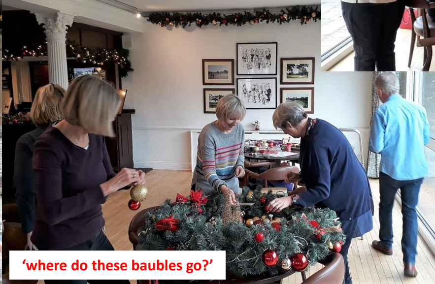
'where do these baubles go?'