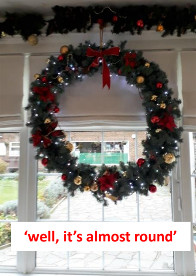
'well, it's almost round'