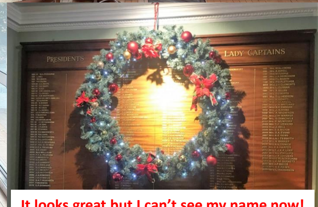
It looks great but I can't see my name now!