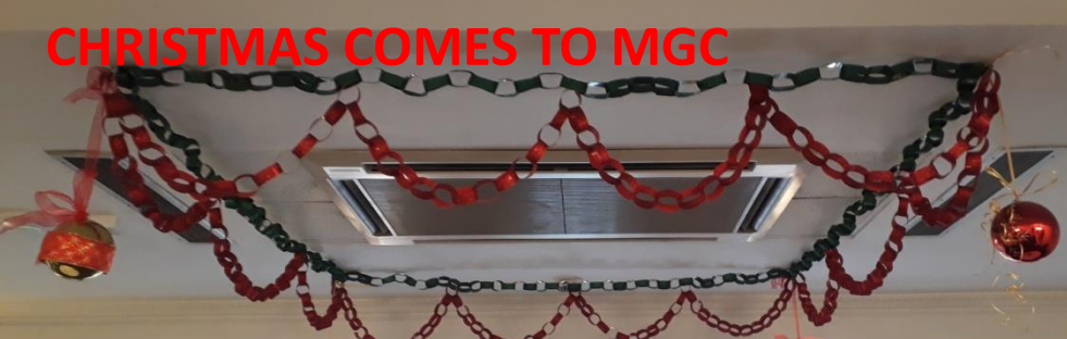
A work of art? Ewan's centrepiece decoration in the restaurant