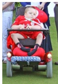
Wheelchair No 265