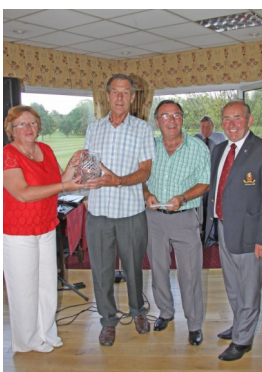
MEGA Trophy Winners

Our 13th Mega Day took place on Wednesday 6th August. After a showery start, 27 teams of supporters and MEGA players enjoyed a fine afternoon of golf.