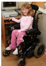
Wheelchair No 226