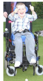
Wheelchair No 275