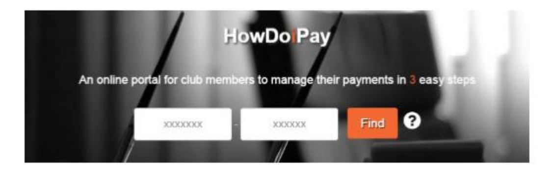
Step 1 - Please enter your unique HowDoIPay invoice reference, which can be found at the top right-hand side of your invoice.

Online payments can be made by logging on to How Do I Pay directly via <a href="www.howdolpay.com">www.howdolpay.com</a>. This will bring up the following screen: