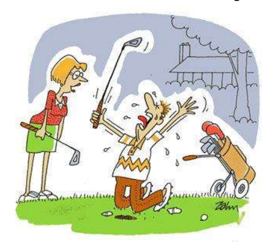
"You always tell me it's only a game."

Right now it's rough growing time! Fortunately we've just taken delivery of a new Toro rough mower which will improve the speed and efficiency with which we can control the rough. Inevitably this will not solve all our problems but I am determined that we should keep the course in a pleasantly playable condition for all standards of golfer whilst stiffening it up a bit for the club championship. Please tackle me if you come across any particularly annoying issues!!