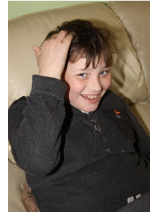
Wheelchair No 295