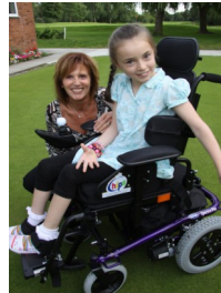
Wheelchair No 268