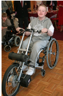
Wheelchair No 246