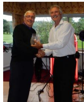
1st Tony Brutus Trophy Winner