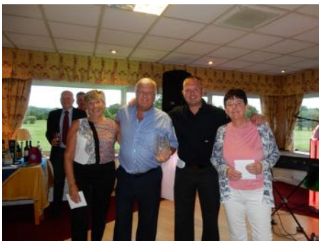
MEGA Trophy Winners

Thank you to everyone who helped raise £1,939 for the Appeal.