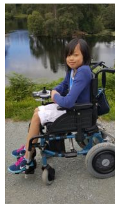
In the Lake District