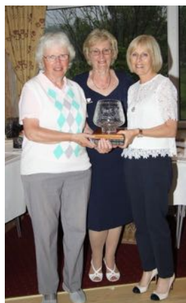
Ladies' Trophy Winners

- And last but not least, all the following local and not so local businesses for the prizes for the competitions, the raffles and the auction