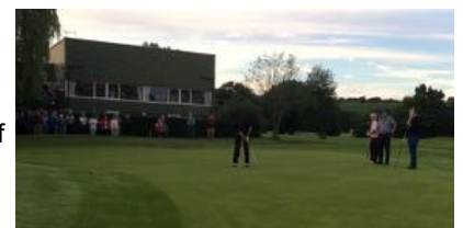
The Final Putt

He travelled 261 miles, spent 10 hours 58 minutes playing 108 holes of golf, scored 508 gross (net 448), lost 1 ball and raised £9,600 for the Appeal. Incredible!!