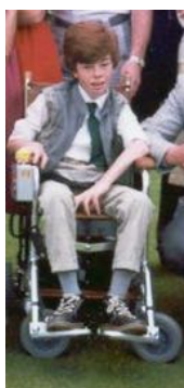
Wheelchair No 10