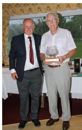
Gents' Trophy Winner