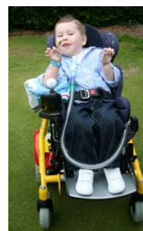
Wheelchair No 232