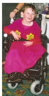
Wheelchair No 152