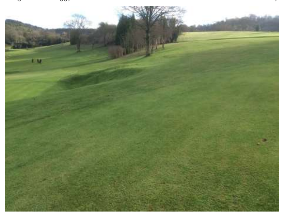
Image 13: No buggy to be taken within five metres of the bank on the 4^{\text{th}} fairway