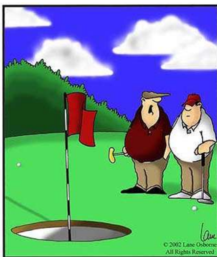
"I don't know what it is about it, but I love this course!"

Your patience would be appreciated but any critically constructive comments would be welcomed.