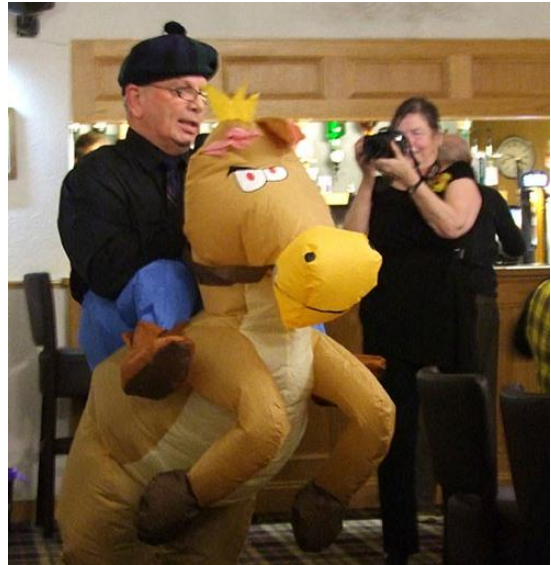
Burns Night - Tam O'Shanter and Meg