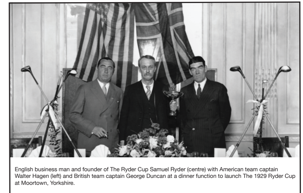
English business man and founder of The Ryder Cup Samuel Ryder (centre) with American team captain Walter Hagen (left) and British team captain George Duncan at a dinner function to launch The 1929 Ryder Cup at Moortown, Yorkshire.