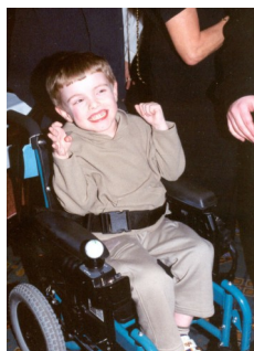
Wheelchair No 122