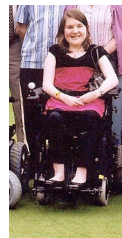
Wheelchair No 227