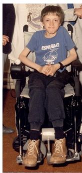
Wheelchair No 32