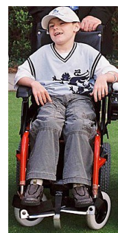
Wheelchair No 211