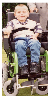
Wheelchair No 81