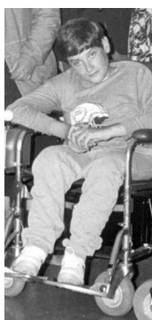
Wheelchair No 25