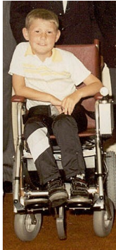
Wheelchair No 37