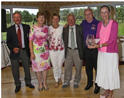
MEGA Trophy Winners

Our 14th Mega Day took place on Wednesday 5th August.