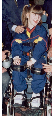
Wheelchair No 104