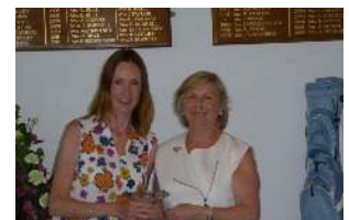
Ladies' Captain's Day