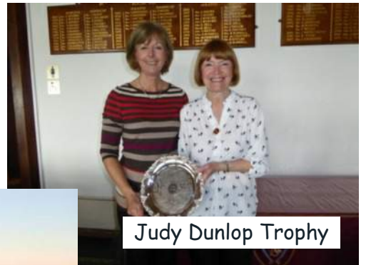
Judy Dunlop Trophy