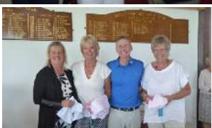
Ladies' Professionals Day