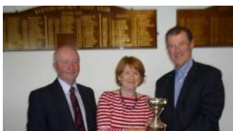
Mixed Dinner Comp