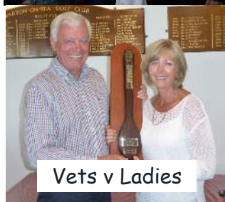
Vets v Ladies