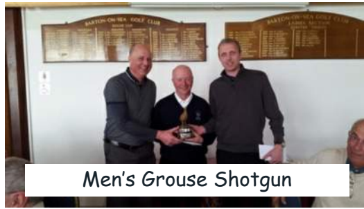
Men's Grouse Shotgun