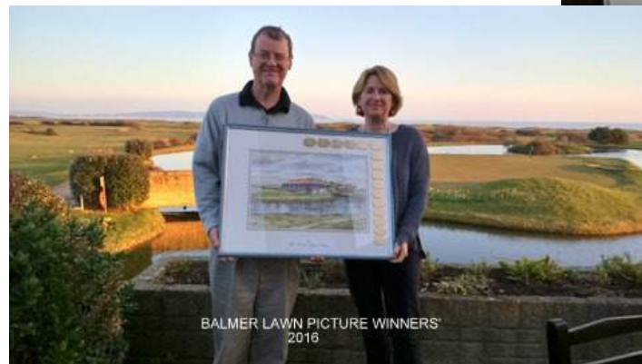
BALMER LAWN PICTURE WINNERS 2016