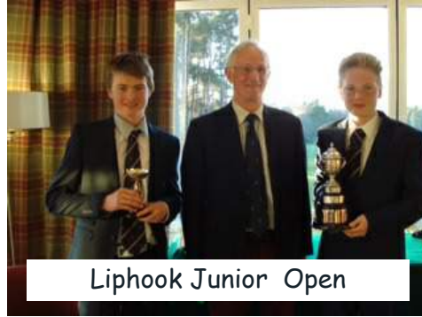
Liphook Junior Open