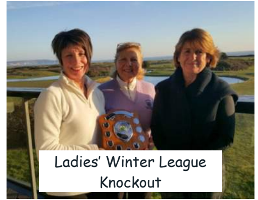
Ladies' Winter League Knockout