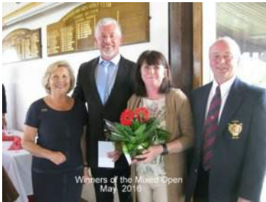
Winners of the Mixed Open May 2016