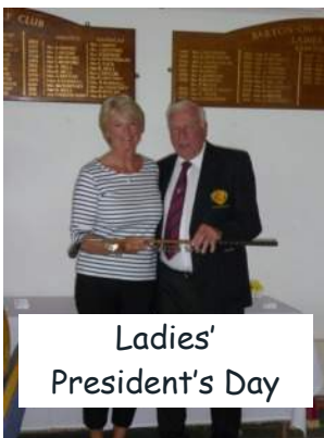
Ladies' President's Day