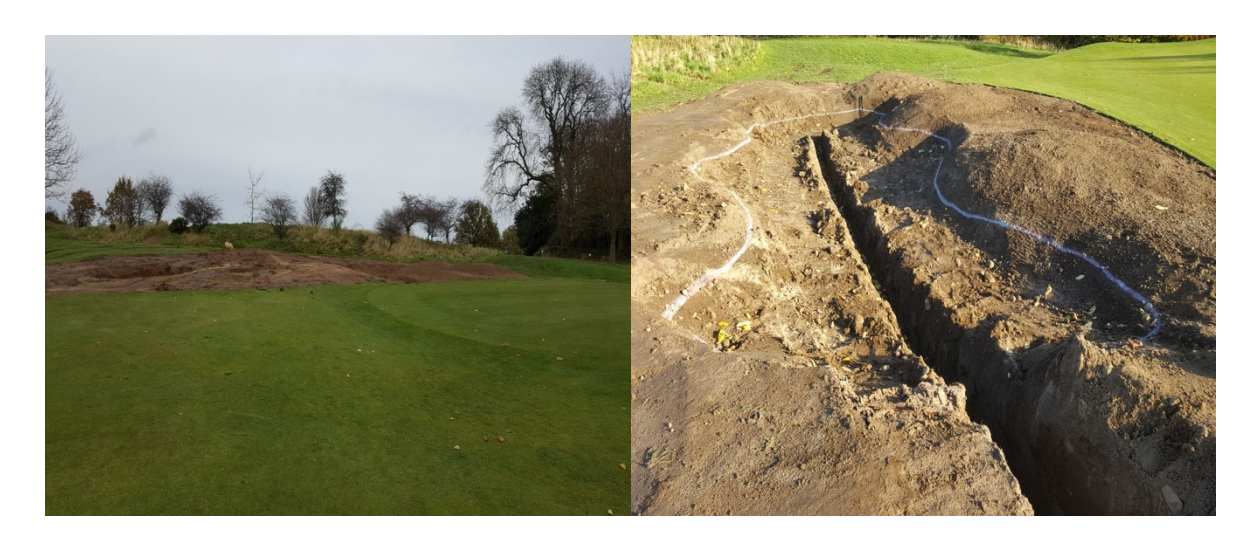
Remodelling left hand bunkers at 5^{th} . Drainage and outline of new shape 5^{th}

On the 6<sup>th</sup> we have addressed a few issues from last seasons work . We have reduced the slopes to the level of soil making an easier entrance into the bunkers. The LHS bunker has been enlarged for better playability and accessability. The drains in the bunkers have been increased and additional drains shaped above and around both bunkers to try and catch water before it goes into the bunker.