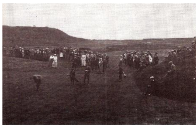
An early exhibition match H. Vardon putting on the 15th Green.