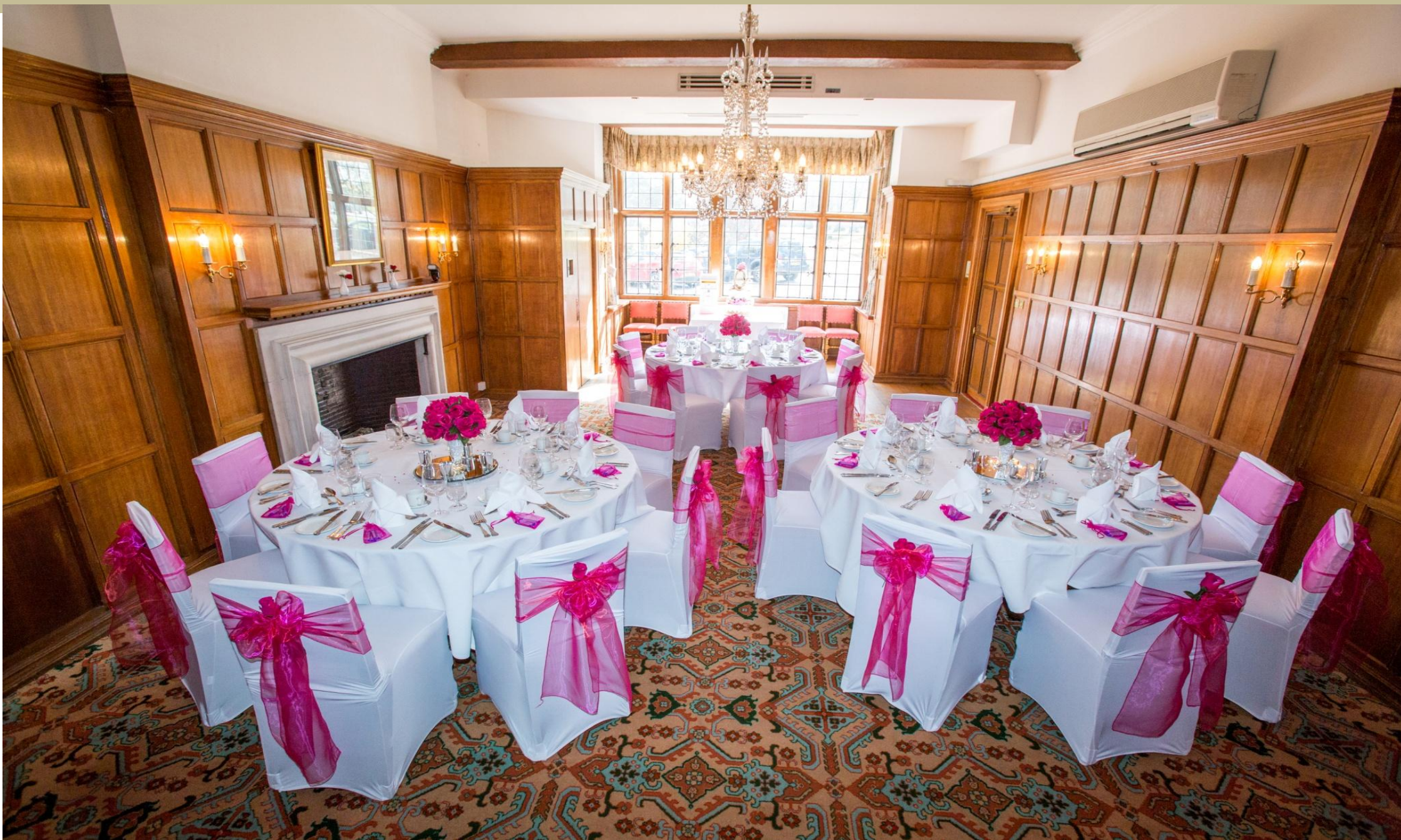
Brickendon Grange Golf Club, Pembridge Lane, Brickendon, Hertfordshire, SG13 8PD T: 01992 511258 E: events@bggc.org.uk W: www.bggc.org.uk