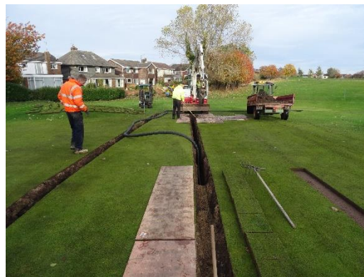
(Drainage work at TGC)

First they had to overcome the impact of the Beast from the East and later in the year deal with the effects of the hottest summer on record. Nevertheless, after just a few months the improvements in the greens – backed by TGC's investment, particularly at the 13 th and 14 th holes – were recognised in the overwhelming approval of members which they expressed through August's survey.