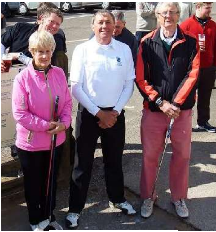
The Captains Drive In

I am always available on the end of a phone or in the clubhouse for a chat and a beer.