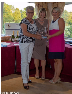
Ladies' Trophy Winners