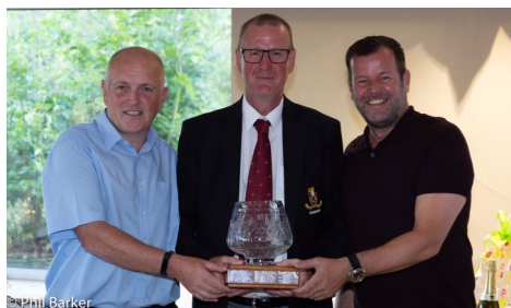
Gents' Trophy Winners

The day was rounded off with an auction and raffle which helped to swell the proceeds.