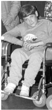
Wheelchair No 25