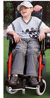
Wheelchair No 211