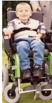
Wheelchair No 81