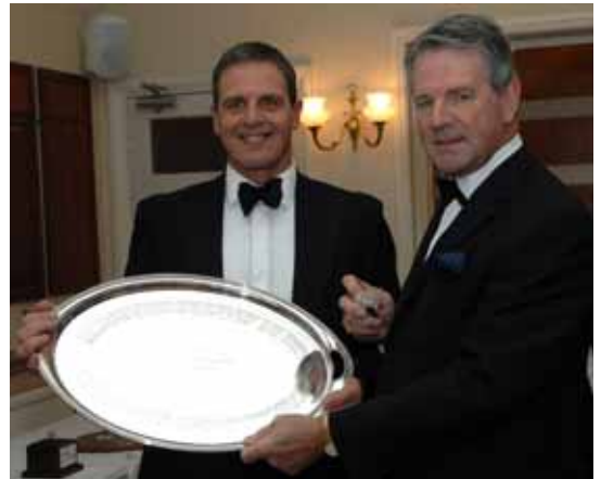
Phil Collins - Lady President's Salver