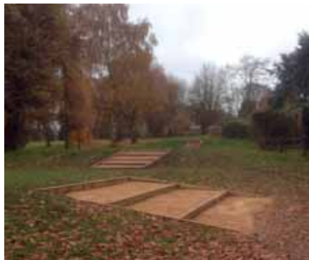
The recently installed steps on the 4th tee.

of the irrigation system with new tank, pump station and bore hole.